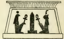
ANCIENT BREASTPLATE REFERRED TO IN TEXT.